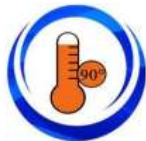
Max Service Temperature: 90°C