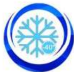
Min Service Temperature: -40°C(Fixed)