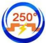
Max Short- circuit Temperature: 250°C (Max.5 s)