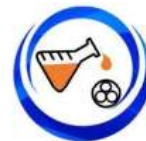
Chemical & Oil Resistance